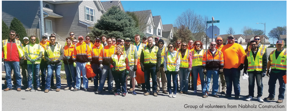
Group of volunteers from Nabholz Construction

Are you part of a community group or business that is seeking a way to give back to our city? Volunteer to take part in Lenexa's Adopt-A-Spot beautification program, which helps make the city safer and cleaner. You'll choose a public park, trail, stream, street or neighborhood location and commit to cleaning it up three times a year for a period of two years. We will provide the necessary supplies and training for your group and offer recognition for your efforts.