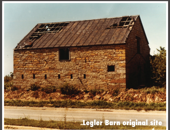
Legler Barn original site

You can read the history of how the barn was originally constructed and how a group of dedicated citizens saved the structure that now stands in Sar-Ko-Par Trails Park by visiting the Lenexa Historical Society's website at LenexaHistoricalSociety.org .