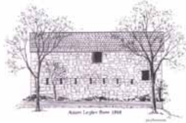
The Lenexa Historical Society is dedicated to the appreciation, preservation and promotion of Lenexa's historical heritage through management of the Legler Barn Museum and Lenexa Train Depot.

Lenexa Historical Society 14907 West 87th Street Parkway Lenexa, Kansas 66215-4135