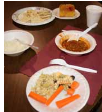
LHS November Gen. Mtg. Dwight Eisenhower