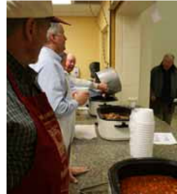
LHS Soup Luncheon February 2012