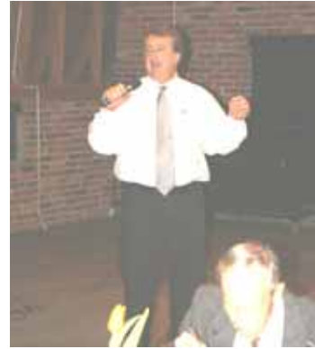
LHS General Meeting March 2012