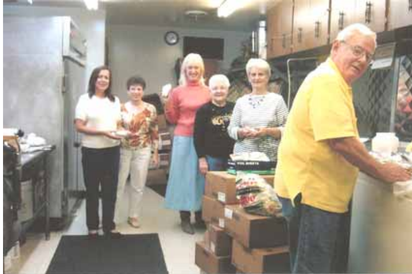
Wrapping potatoes for the Pork Chop Dinner.